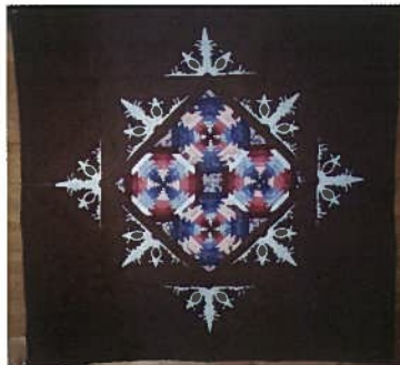
Hawaiian Pineapple Applique

Pineapple Applique features yards of small stitches and an intricate central medallion applique design. Amish men and women from New York, Pennsylvania, Ohio and Kentucky have pieced each work of art on treadle sewing machines.